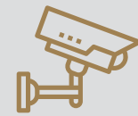
Round-The-Clock CCTV Cameras